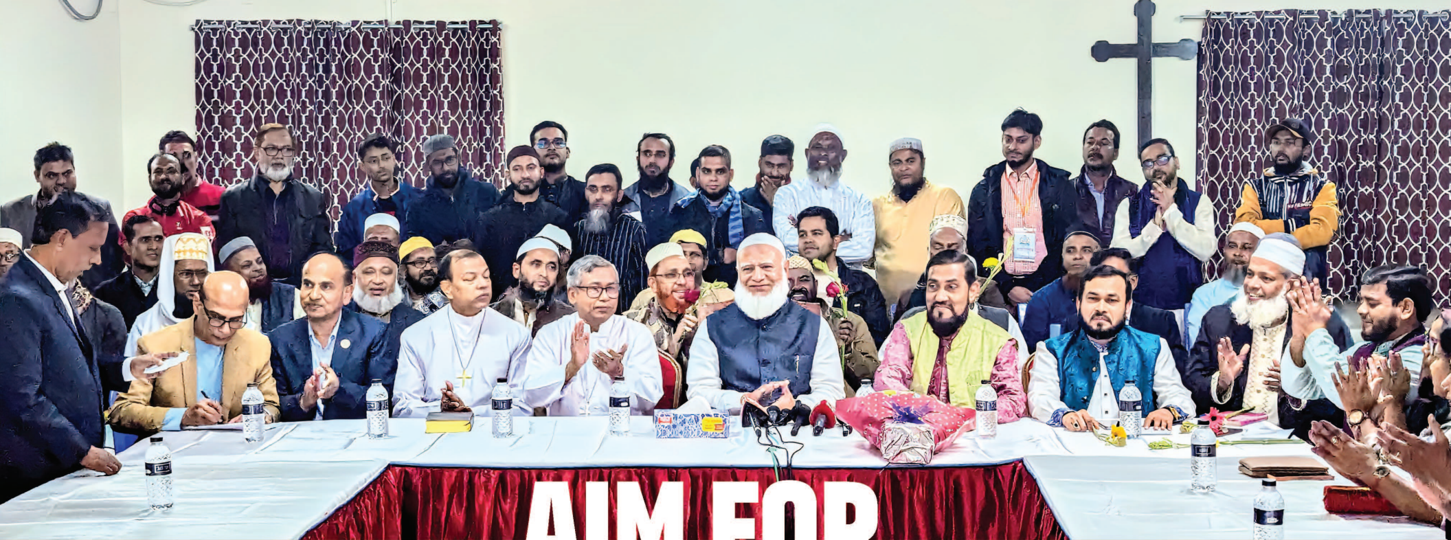
**Party Chief's visit to the church – promoting religious harmony