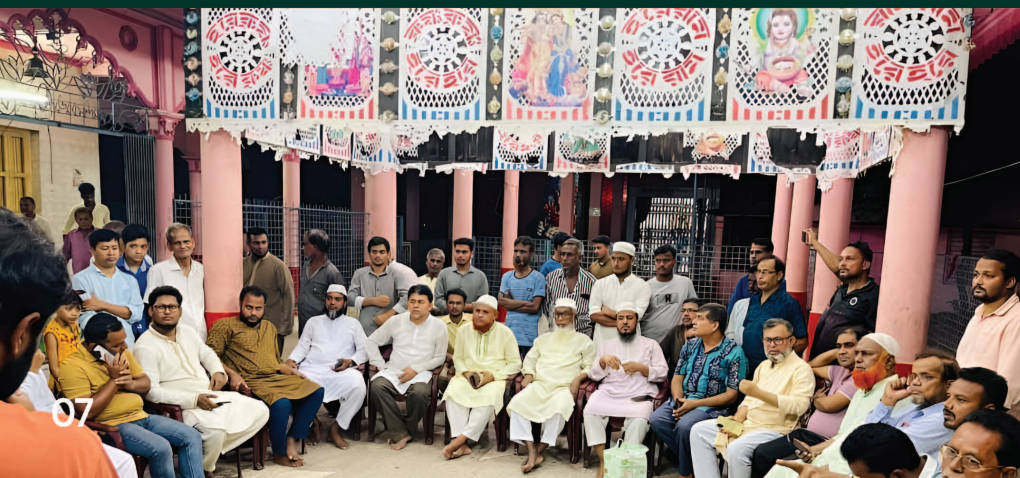
**Party Chief engages with the Buddhist Community – Fostering inclusivity and mutual harmony

During the transition period, BJI members have actively worked to protect places of worship and minority communities. In the aftermath of the political transition, volunteers from Bangladesh Jamaat-e-Islami and its student wing, Chhatrashibir, played a key role in guarding Hindu temples and Christian churches, ensuring communal harmony during turbulent times. Bangladesh Jamaat-e-Islami stands firmly against the exploitation of religious minorities by political entities and remains committed to protecting their rights and properties.