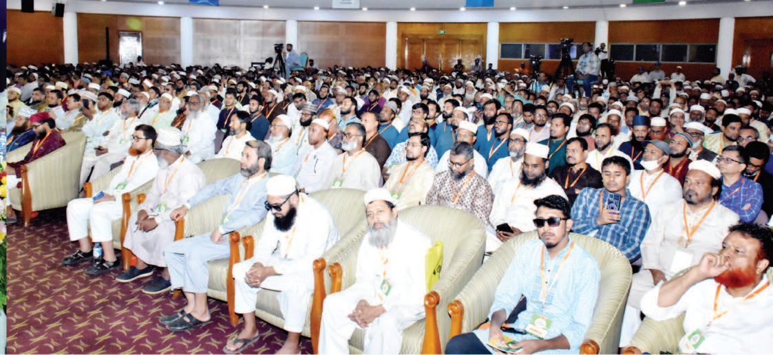
**Jamaat-e-Islami party chief delivering a speech at a public gathering